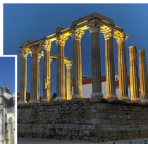
Évora, Portugal, a UNESCO World Heritage Site

Pilgrimage Price: $3,400 per person double or triple