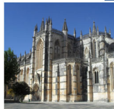
Monastery of Santa Maria da Vitória, Batalha, Portugal